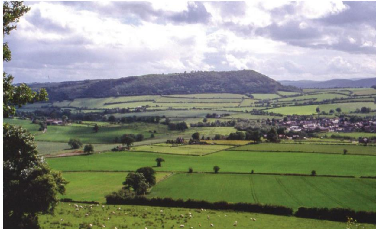
View Edge from the north-east.

Notice the ‘heel’ shape of this hill, which resembles the foot of a person lying down.