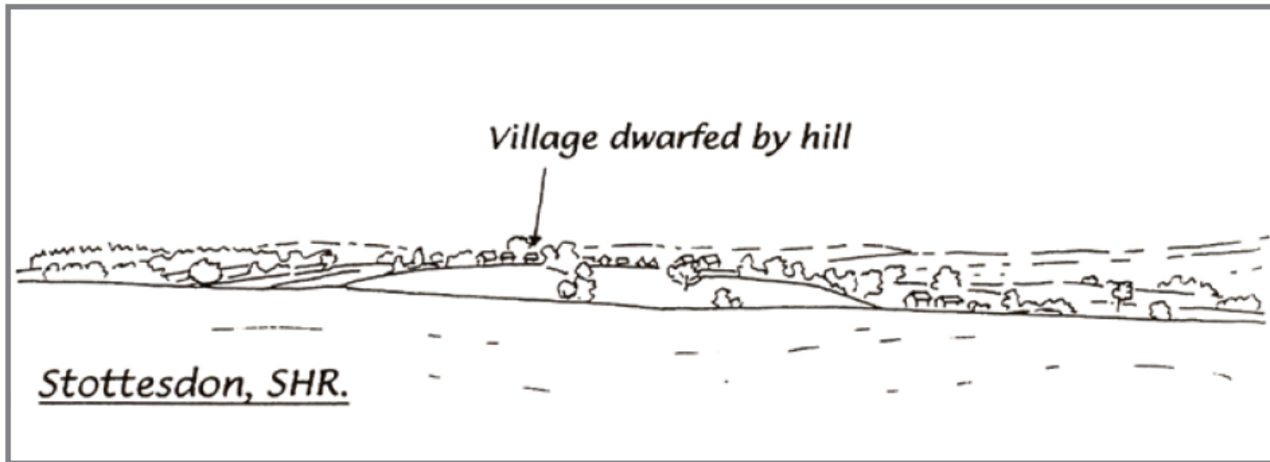
Ann Cole's line drawing of Stottesdon, showing the settlement on top of the level, extensive hill summit — a classic dūn site.