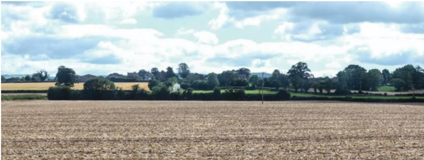
The site of the village of Longden is also characteristic of dūn -named places.